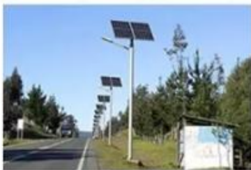
Solar Street Light