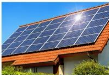
Household Energy Storage