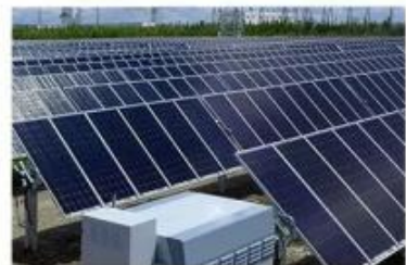
Energy Storage System